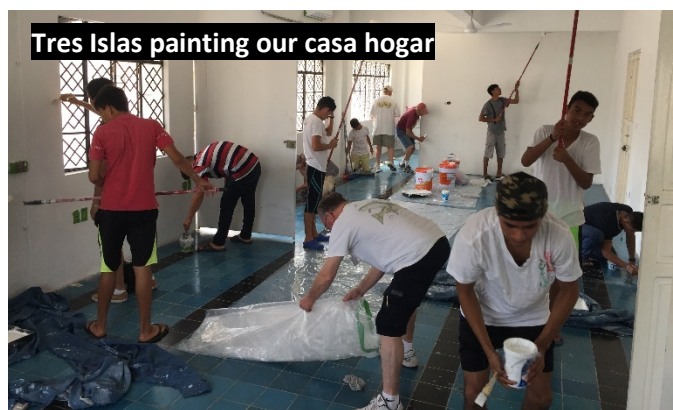
Tres Islas painting our casa hogar