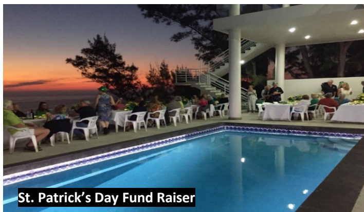
St. Patrick’s Day Fund Raiser