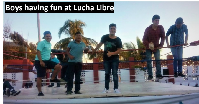
Boys having fun at Lucha Libre