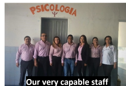
Our very capable staff

Our professional staff of seven remains committed to taking care of the wellbeing of the boys with a focus on education.