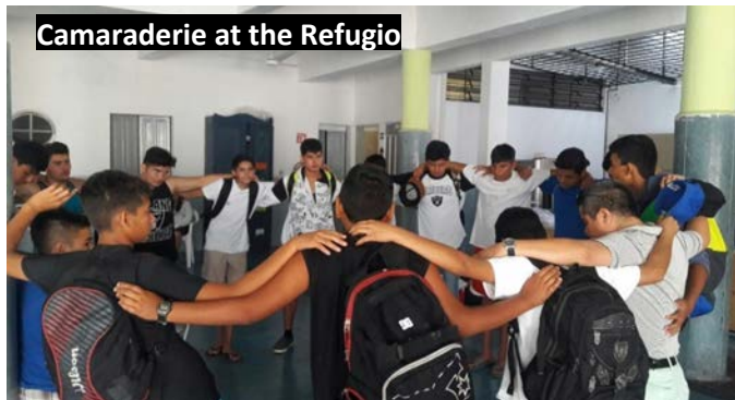
Camaraderie at the Refugio

The kids also took part in a surfing, soccer and pizza afternoon hosted by Back2Back and several of their US visitors.