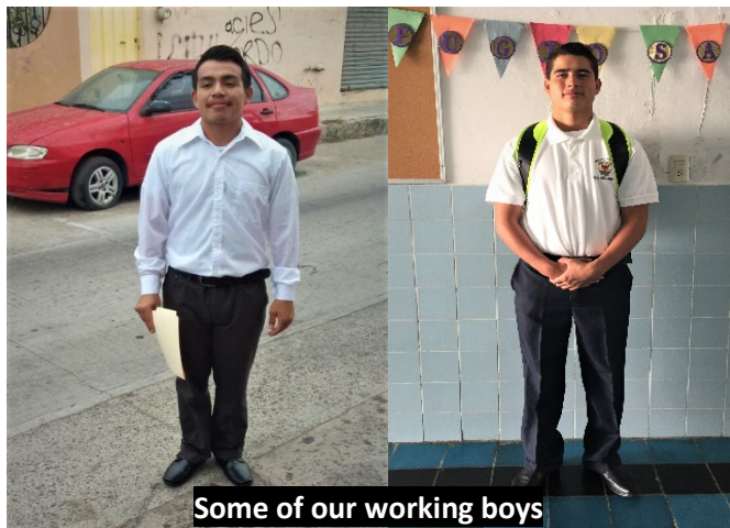
Some of our working boys

Some of our boys have been able to secure part time jobs in their free time including gardening, dog walking and restaurant work. We are most grateful to The Water's Edge, Looney Bean and El Fish Market for giving our boys these opportunities. It provides them a chance to develop new skills, manage their money, learn responsibility and balance their time.