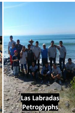
Las Labradas Petroglyphs

In addition, they visited Las Labradas Petroglyphs north of Mazatlán.