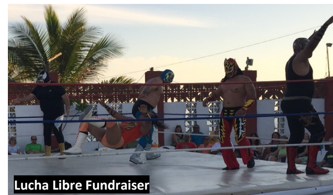
Lucha Libre Fundraiser

In March the boys attended an exciting “Lucha Libre” fundraising event that involved wrestling from local professionals.