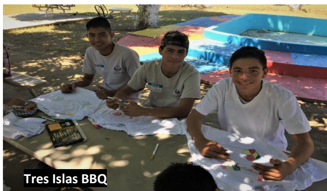
Tres Islas BBQ

Tres Islas is a special friend of our home, providing much needed support for food and other supplies. Several of their donors and board members visited Mazatlán in March for their Spring Mission Week. They held a barbecue for the six Mazatlán orphanages that they serve (including Refugio Mazatlán). The boys enjoyed the many activities that were organized for them, as well as the opportunity to socialize with kids from the other homes.