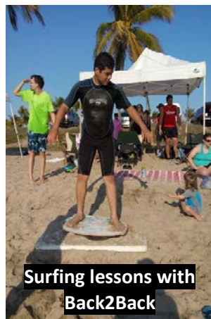
Surfing lessons with Back2Back