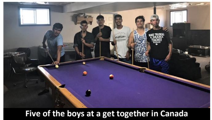
Five of the boys at a get together in Canada