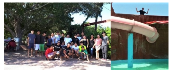
A day at Loma Linda

In August, the kids took advantage of the warm weather and visited Loma Linda, a nearby waterpark. They also spent time at the beach and swimming pools when possible.