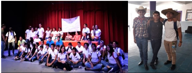
Literacy and Independence Day celebrations

celebrated Independence Day by donning costumes to school and the boys at "CEBA CUAHUTEMOC" IMSS hosted a Literacy Day.