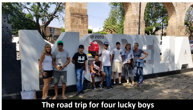
The road trip for four lucky boys