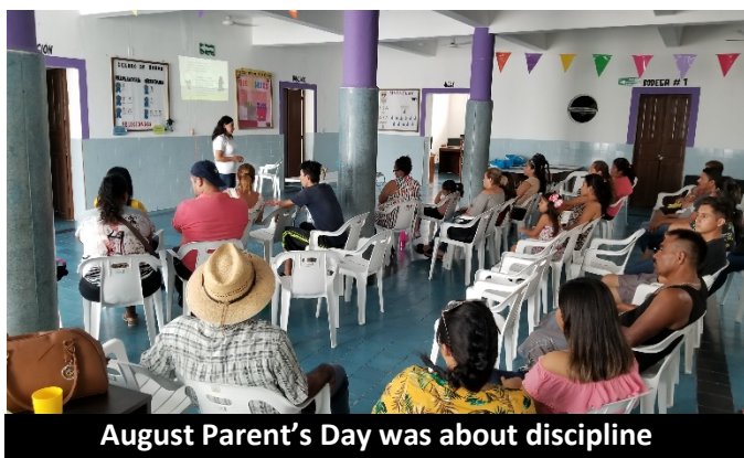
August Parent's Day was about discipline

Every two months the parents or families of the boys attend a "Family Day" at the Refugio. They are counseled on discipline, how to be good parents, and on supporting their children's goals.