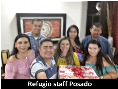
Refugio staff Posado

The Refugio staff held a posada and exchanged gifts. We are most grateful for their efforts in taking good care of and mentoring our boys.