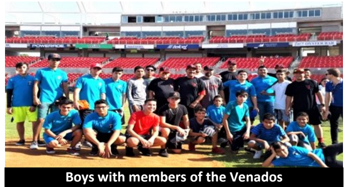
Boys with members of the Venados