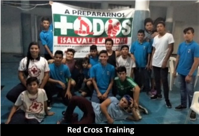
Red Cross Training

The Red Cross visited Refugio in October and taught the boys First Aid. The lessons are useful for the boys as they learn how to deal with emergencies including CPR.