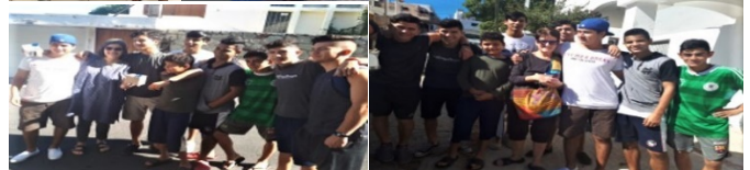
Going around to say thanks to volunteers & donors