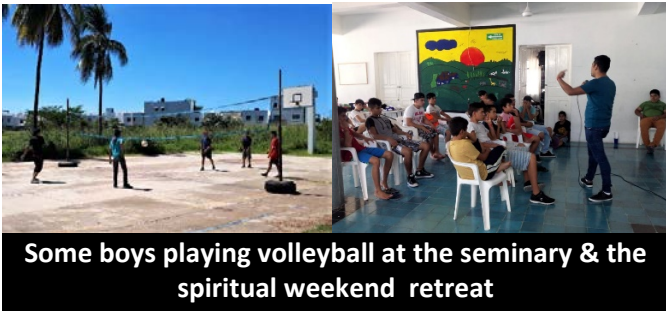
Some boys playing volleyball at the seminary & the spiritual weekend retreat

The Red Cross visited Refugio in October and taught the boys First Aid. The lessons are useful for the boys as they learn how to deal with emergencies including CPR.