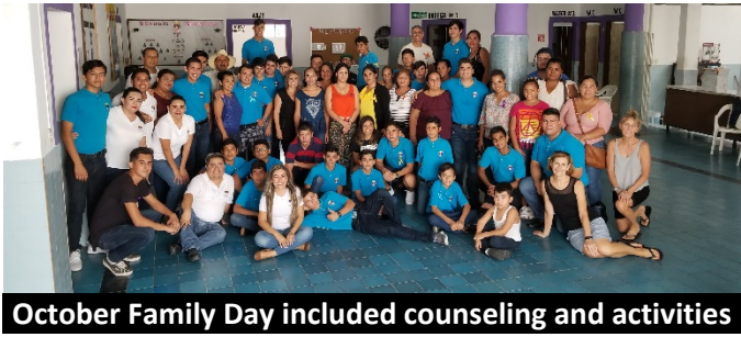
October Family Day included counseling and activities

and activities were also part of the day, followed by lunch.