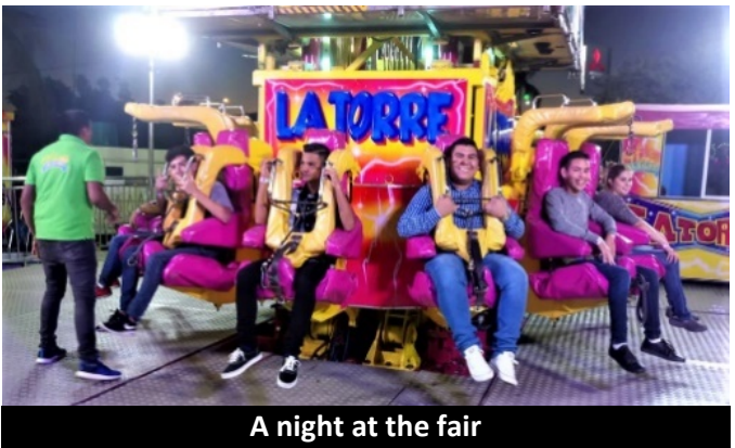
A night at the fair

In December the fair came to town and all the boys were treated to a night in which they were each given an allowance for exciting rides and snacks.