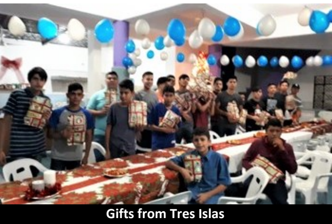
Gifts from Tres Islas

The stockings were hung at the entrance into Refugio creating a most colorful and cheerful display. Many thanks Linda and crew. A number of our boys are also working in Linda’s quilt shop. You will be amazed at the quilts they are creating - we will share pictures when they are complete.